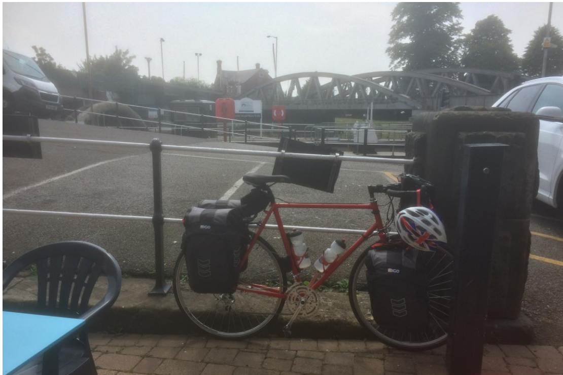
Late lunch at Boston Quay.

My route card said left at the Market Place in Boston, and follow NCR1 signs. Sod's law, it was market day and I could not ride through market place so lost route signs.