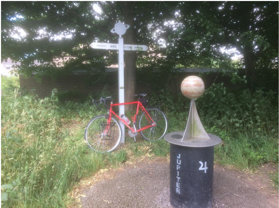
Solar cycle way.