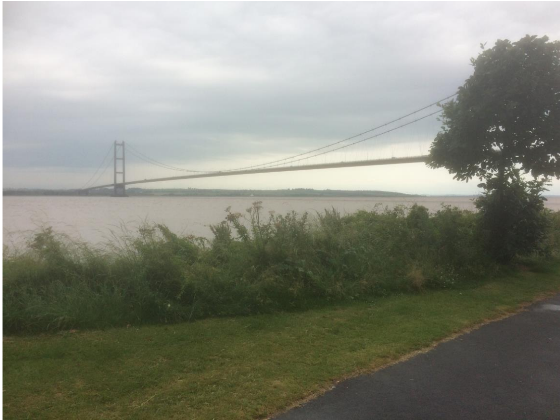
Humber bridge from Hessele.