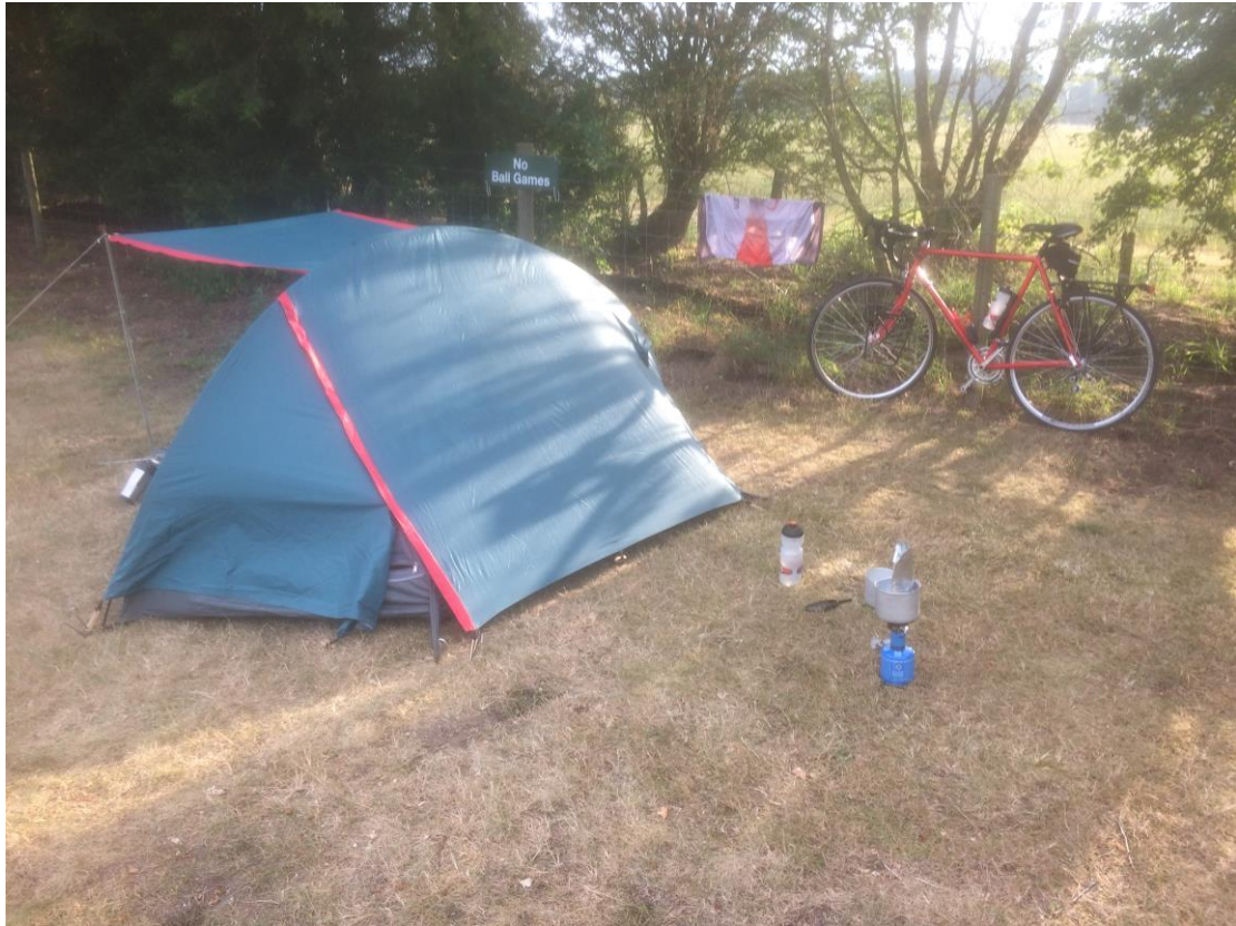
Woodhall Spa campsite, Chicken Masala with chick peas and rice for tea.

From Boston there is a really good cycle way to Langrick bridge, then quiet roads to Tattershall bridge. I thought that I would have escaped all the aircraft noise that we get in Lakenheath, however the Eurofighters from Coningsby seemed even louder. Long flat straight roads into the wind for the rest of the ride into Woodhall Spa.